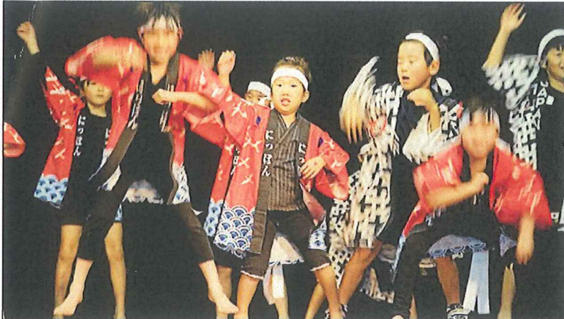
Hughes Primary School students take part in Harmony Day celebrations.

THE CHRONICLE, Tuesday, March 26 2013 - 10